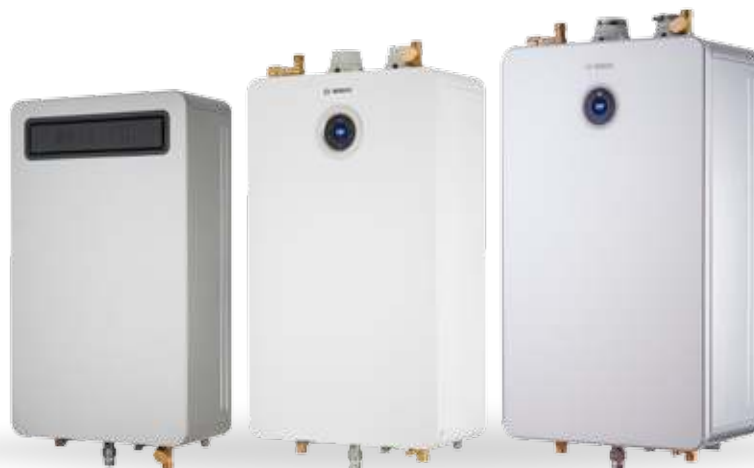
Greentherm T9800 SE outdoor